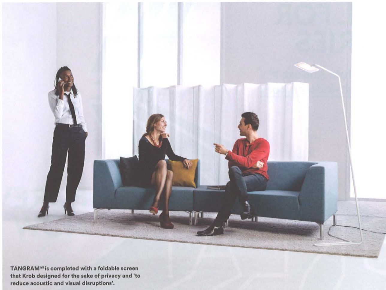
TANGRAM ISS is completed with a foldable screen that Krob designed for the sake of privacy and 'to reduce acoustic and visual disruptions'.

'This is all about creating a compact and flexible communication zone'