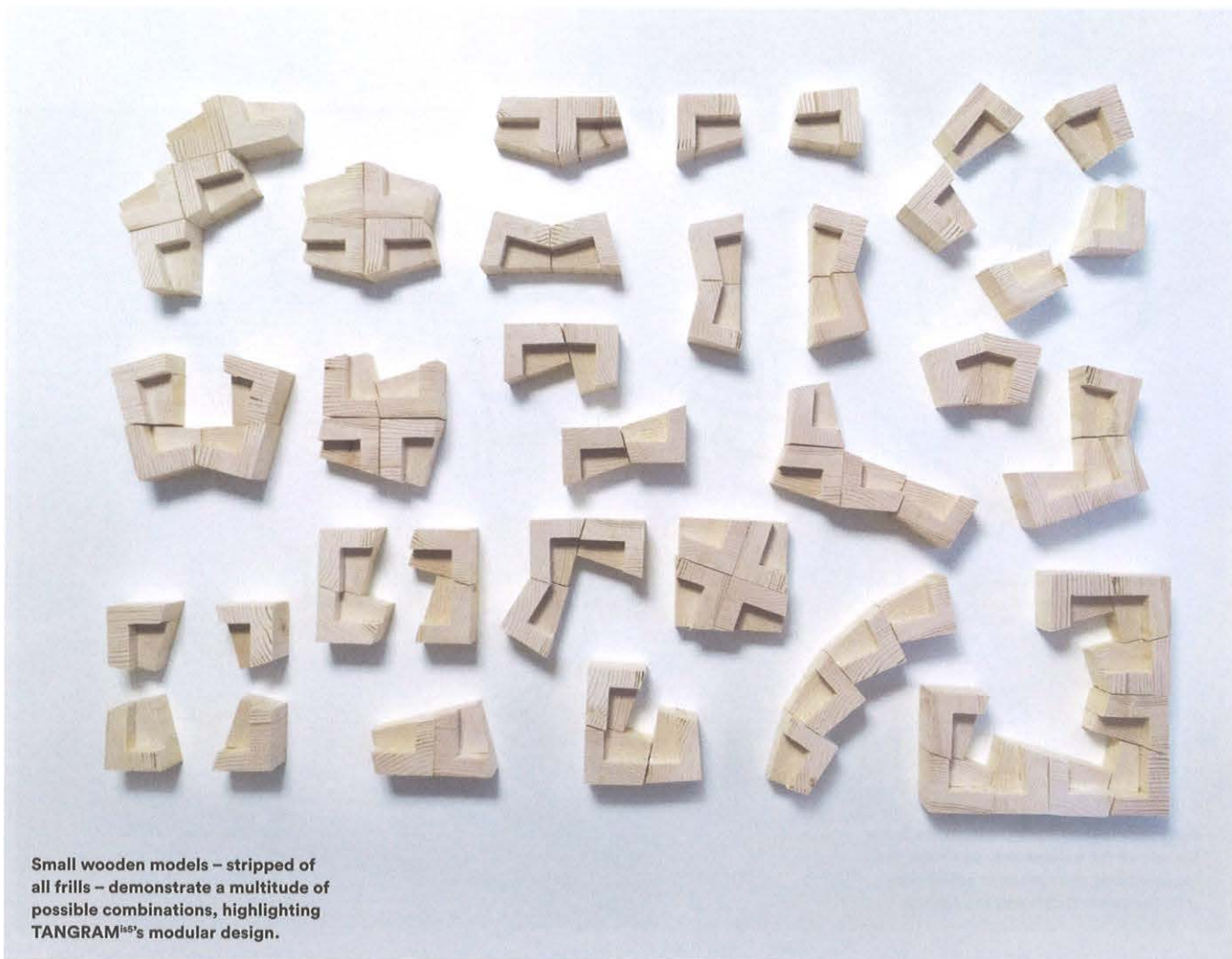
Small wooden models – stripped of all frills – demonstrate a multitude of possible combinations, highlighting TANGRAM is5 's modular design.