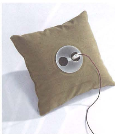
A cushion with integrated electrical sockets is included in the TANGRAM ISS series

Krob uses various rendering programs to visualize his ideas, including formZ, which provides a precise but somewhat abstract representation of a