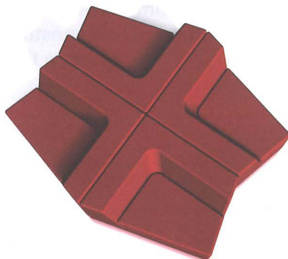
By dividing a simple square into four equal parts, Krob created a cross, which he rotated 15 degrees to generate his asymmetric designs.